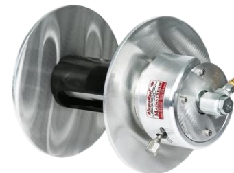
Powder Coated Black Finish