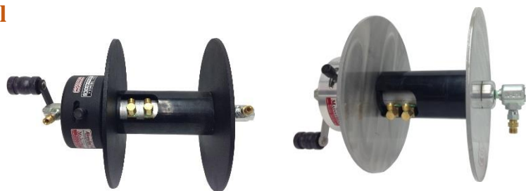
Powder Coated Black Finish