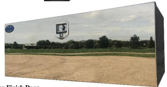
Mirror Finish Door

Note: * = Door is available in diamond thread or mirror finish; add "T" or "M" after part number where * is.