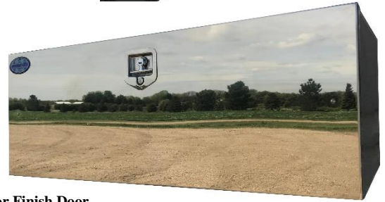
Mirror Finish Door

Note: * = Door is available in diamond thread or mirror finish; add "T" or "M" after part number where * is.