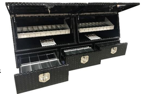
Powder Coated Black Shown with Shelf