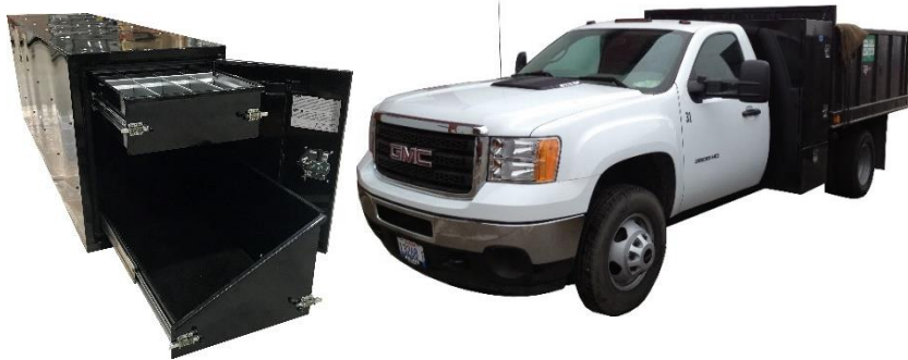
CPS42D Boxes have Optional Drawers as shown.

Note: *Boxes are available in black and white, add “b” for black and “w” for white after part number.