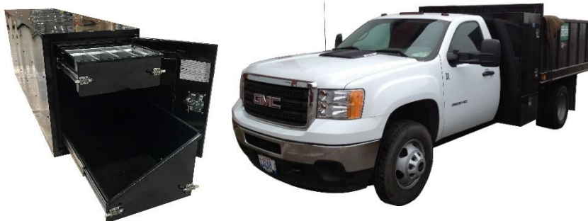
CPS42D Boxes have Optional Drawers as shown.