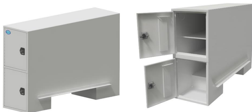
Double & Single Door