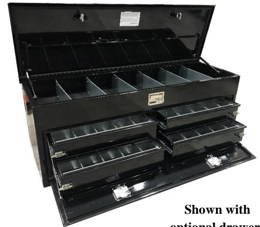
Shown with optional drawers STB4-D4-212060

Notes: * Boxes are available in black and white, add “b” for black and “w” for white after part number.