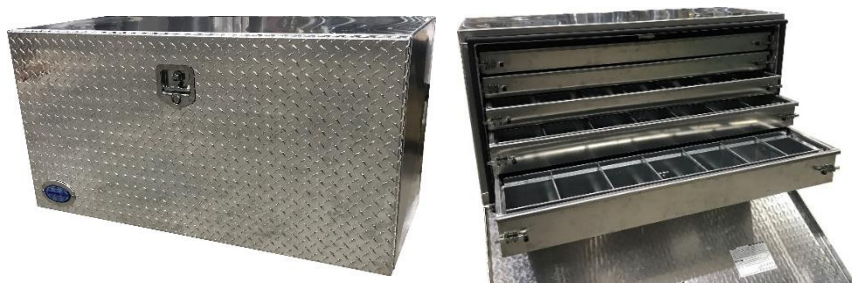
Steel 4 Drawer Box