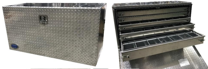
Steel 4 Drawer Box