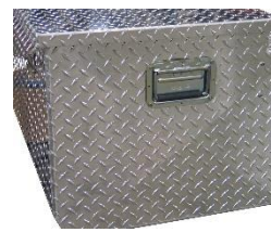
End View Showing Inset (Offset) and with Optional Handle