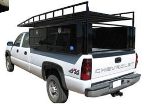
Optional Shelf Shown