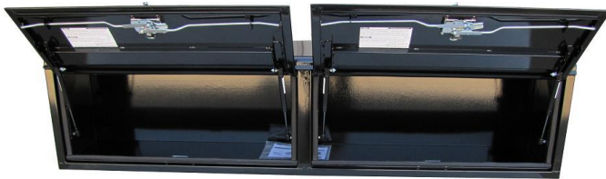
Top Hinged Bottom Open