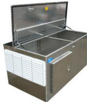
Shown above is a Left Configuration (Access Door)