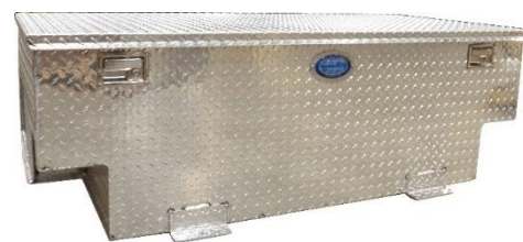
Aluminum Tank Notched STT42 or ATT52