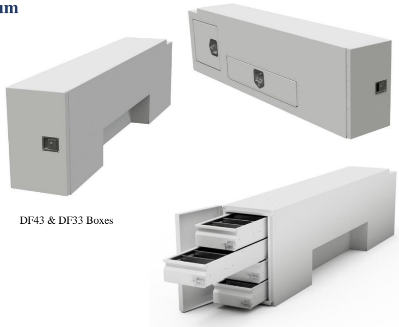
DF43 & DF33 Boxes