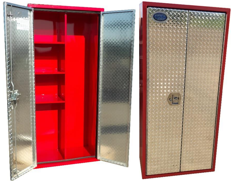
AGC41-651830DD-SOT Powder Coated Red