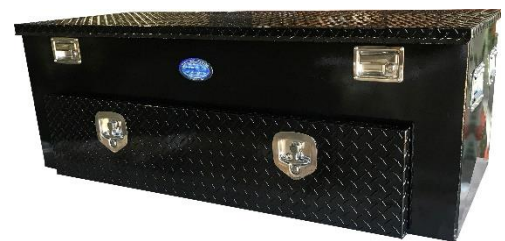
ATCP42 Powder Coated Black