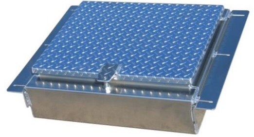
AIFB5B = Pad Lock locking

In-Frame boxes are super heavy duty, high capacity and offer easy access from back of the truck. Boxes are available with Padlock or T-Handle Lock. Boxes are perfect for standing on when changing trailer connections or a perfect way to store your equipment, like chains, binders, straps or your personal gear. In-Frame boxes are available in different sizes, ranging from 12" to 48" or can be ordered in custom size. All AMERICAN TRUCKBOXES boxes are designed and built to keep your equipment safe and secure.