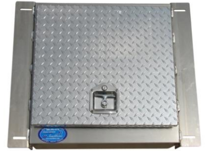
AIFB5T = T-Handle locking